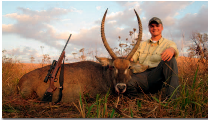
Jake Norris: Waterbuck.