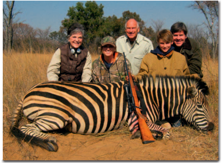
Rett Canon: Burchell Zebra.