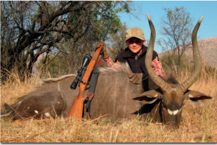
Rett Canon: Nyala.