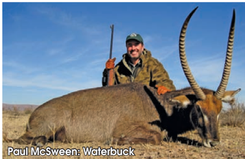
Waterbuck