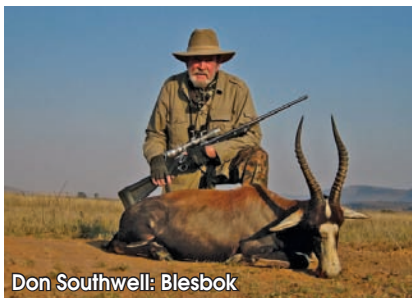
Don Southwell: Blesbok