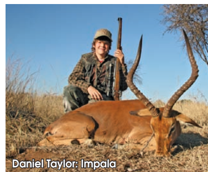
Impala